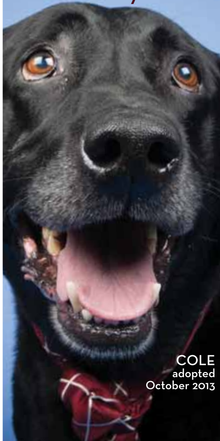
COLE adopted October 2013

Rescuing an old dog is like finding a vintage treasure.